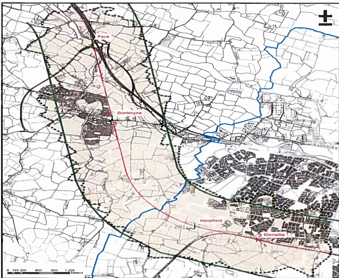
Extent of the Supplementary Scheme for Phase 1 of the Navan Railway Line