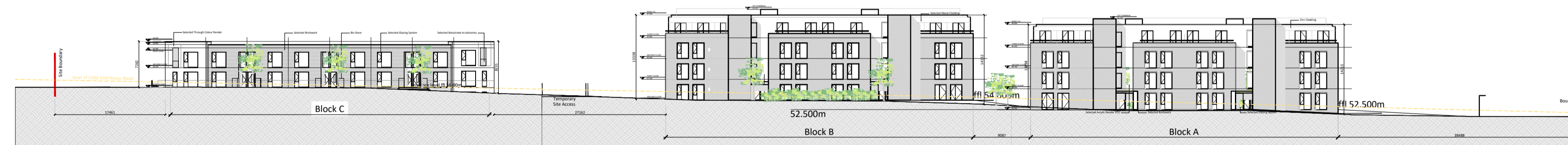
CONTIGUOUS ELEVATION ONTO EASTERN ACCESS ROAD Scale 1:500@A1