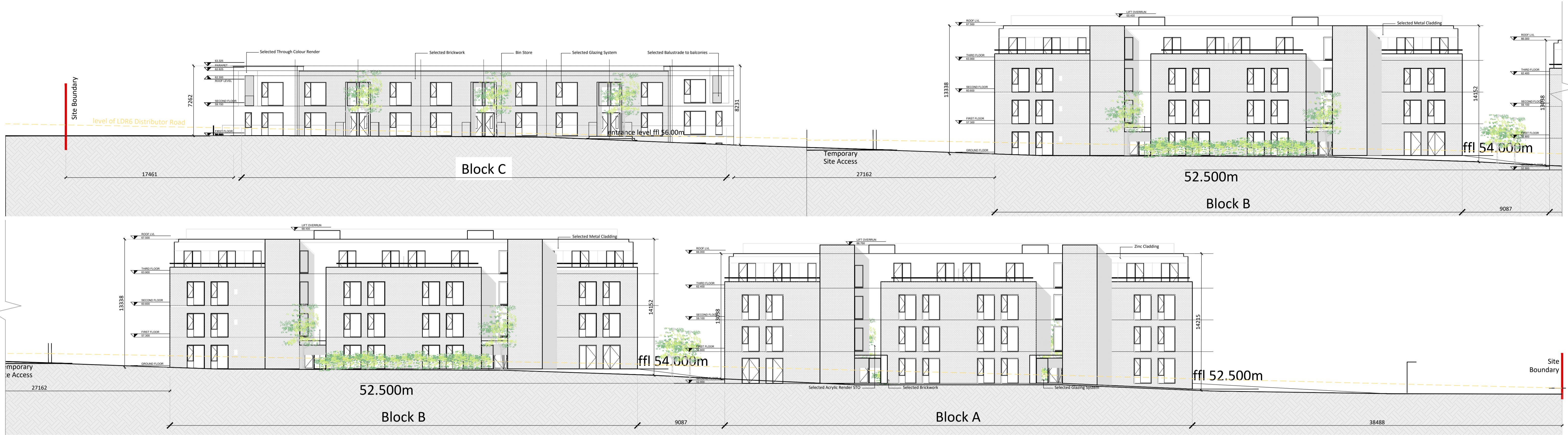
CONTIGUOUS ELEVATION ONTO EASTERN ACCESS ROAD Scale 1:200@A1