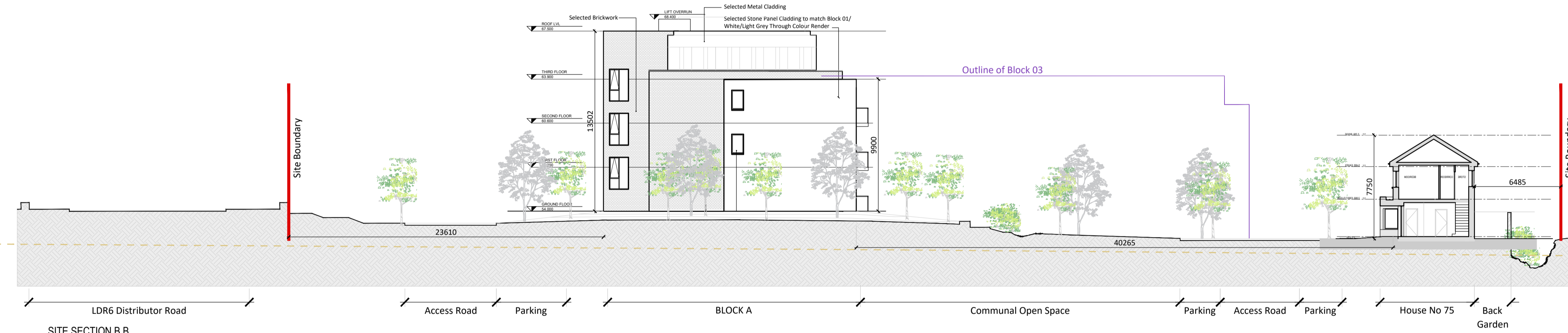
SITE SECTION B B Scale 1:200@A1