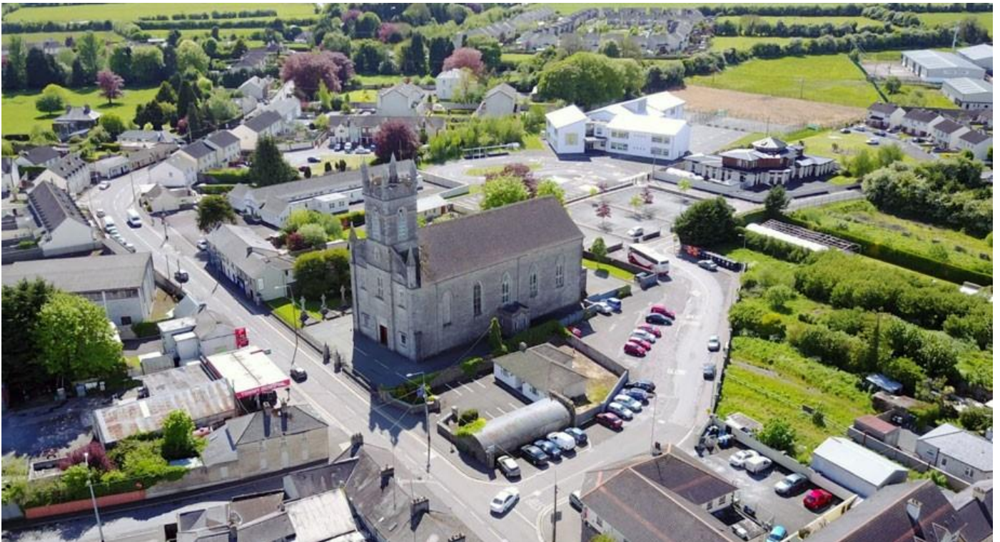
St. James' Catholic Church Athboy