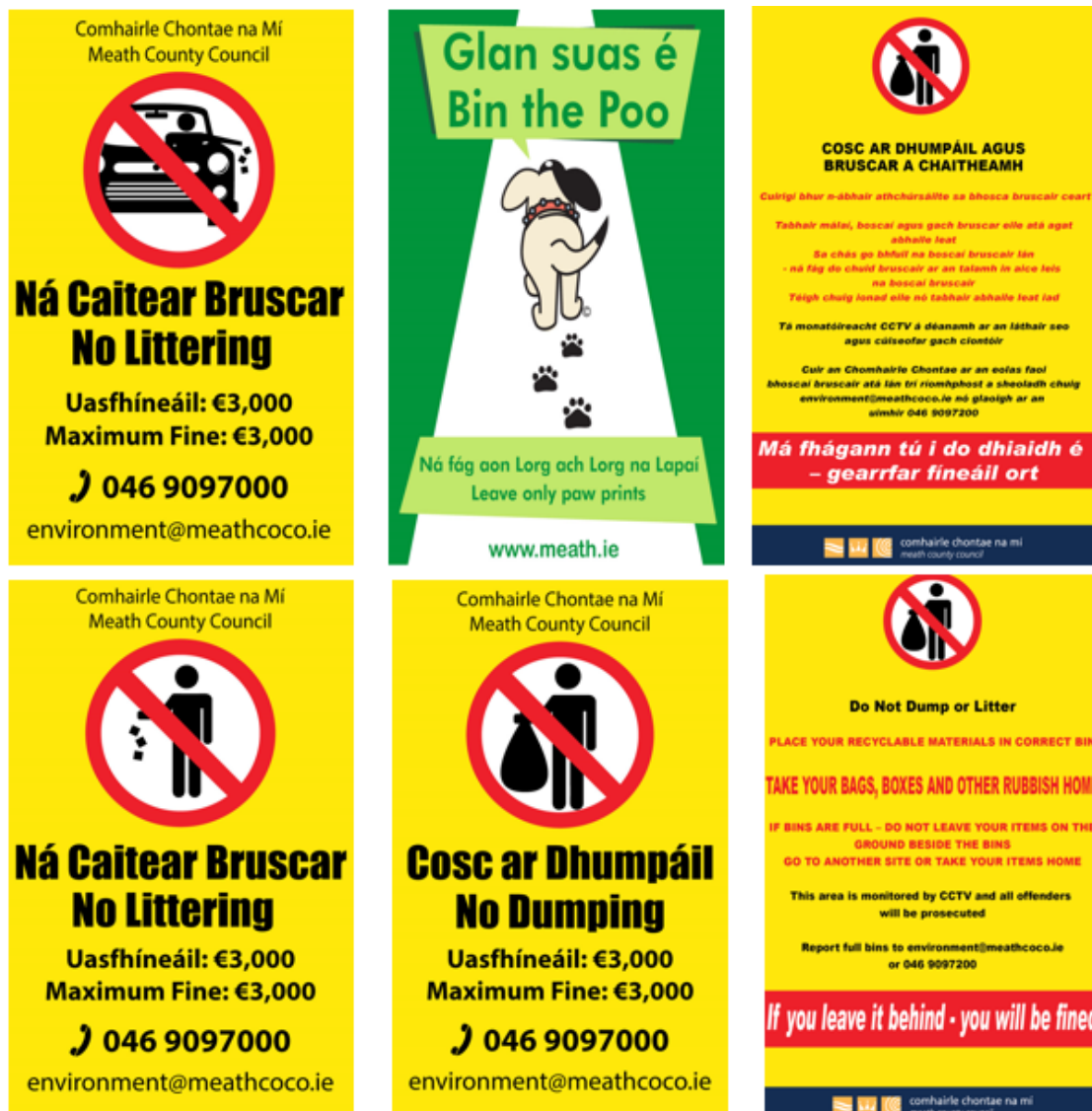
Anti Dumping and Anti Litter Signs, Meath

Litter Wardens work with community and voluntary groups to co-ordinate clean ups, provide equipment and remove waste when it has been collected.