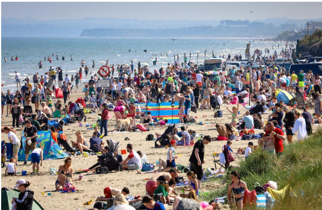
Summer 2021, at Bettystown Beach

Major and Minor Events generating litter – Events such as sporting events, concerts, festivals etc. can generate a substantial amount of litter. The nature of the litter is usually casual and package related. Events Management Plans deal with waste and litter arising as part of the planning process for large events.