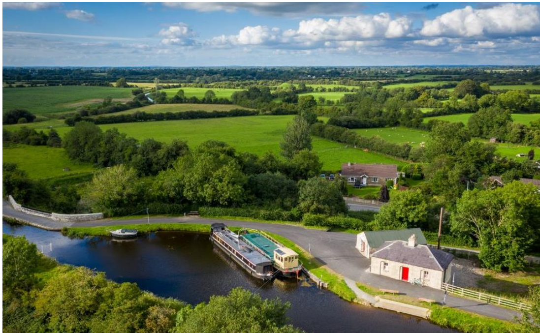
Royal Canal Greenway at Ribbontail Way, Longwood