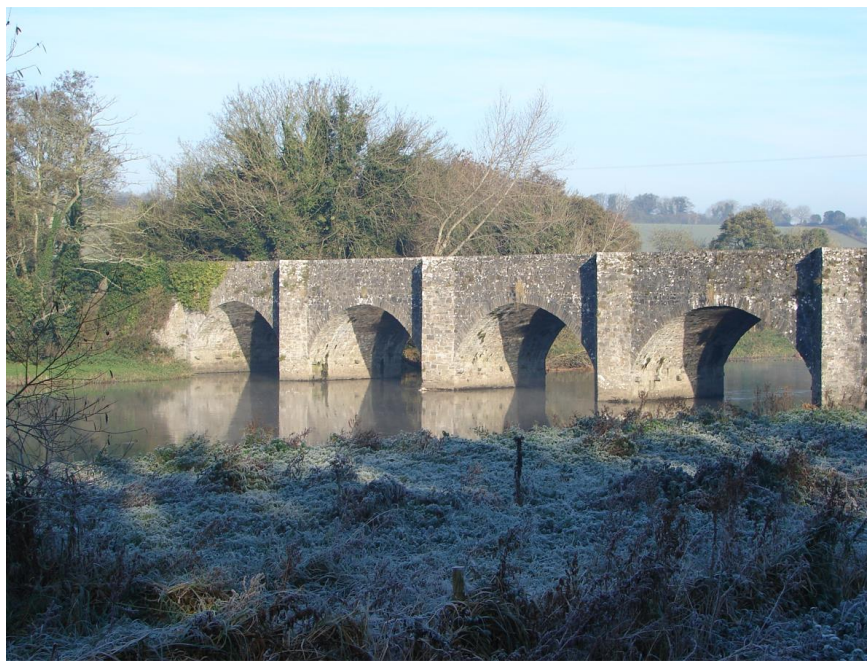
Broadbridge, from the Ramparts Walk

Every effort will be made to increase the numbers participating in Green Schools, Pride of Place, Spring Clean, Green KM and other such environmental campaigns all of which are hugely effective in the fight against litter.