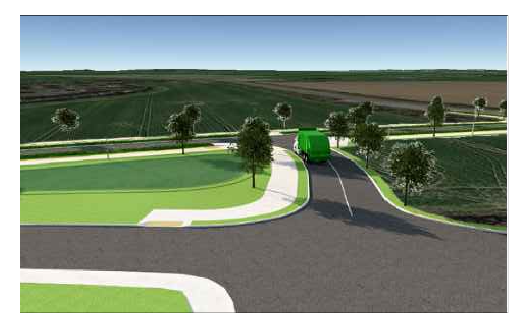
PROPOSED THORNTONS ACCESS VIEW