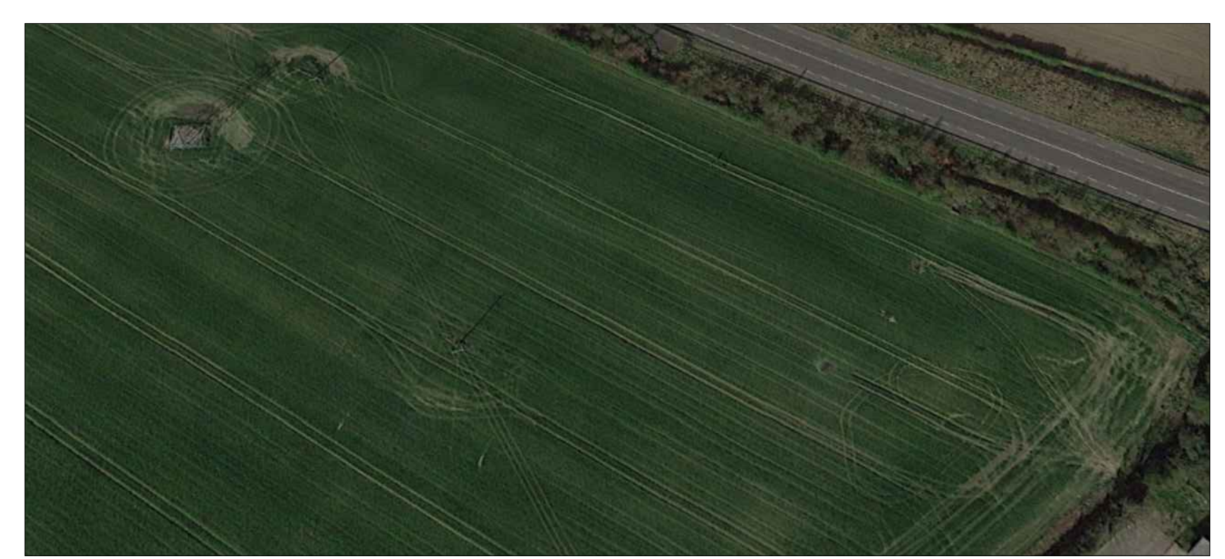
EXISTING DUNBOYNE BUSINESS PARK VIEW