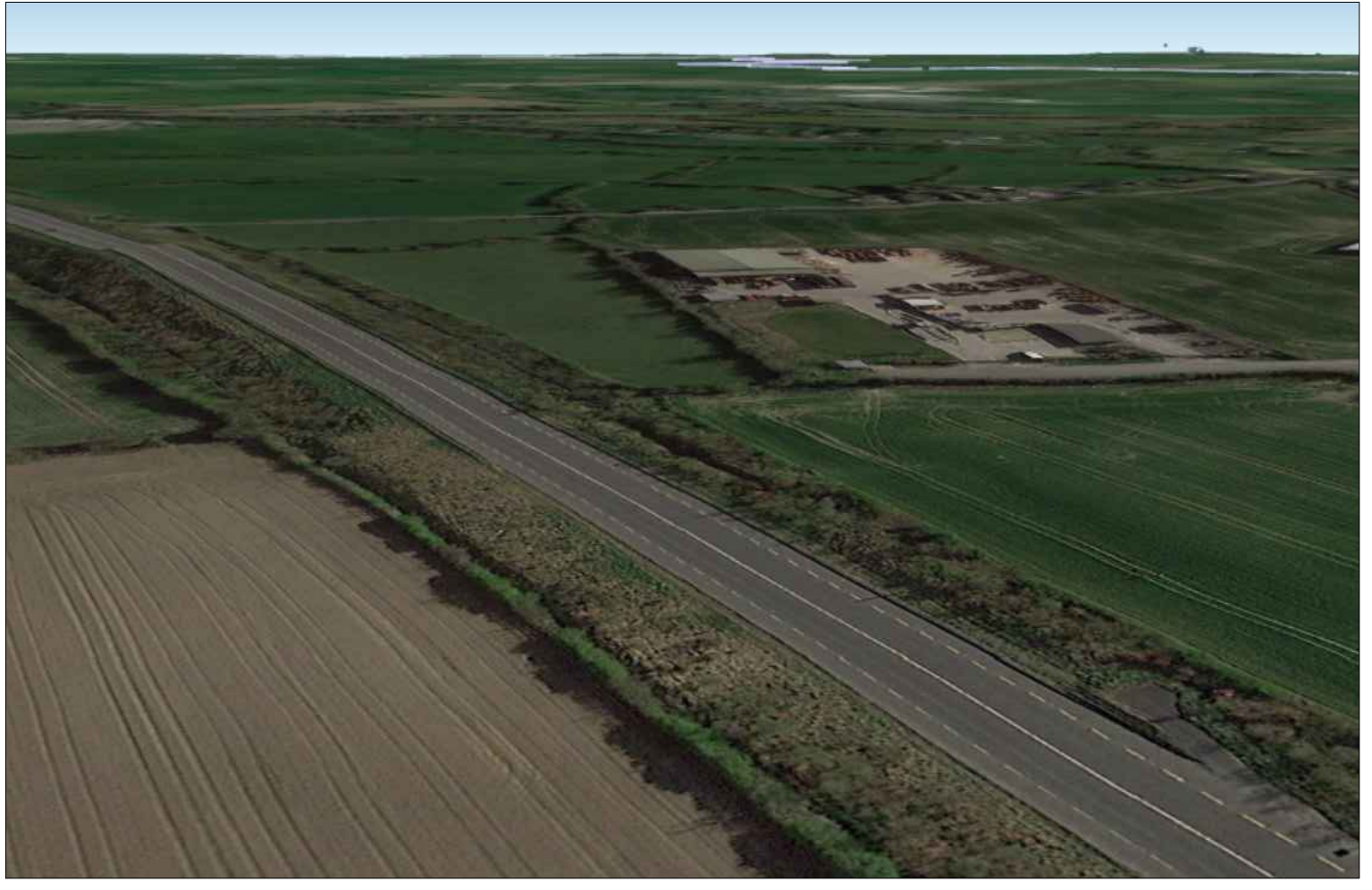
EXISTING R157 VIEW