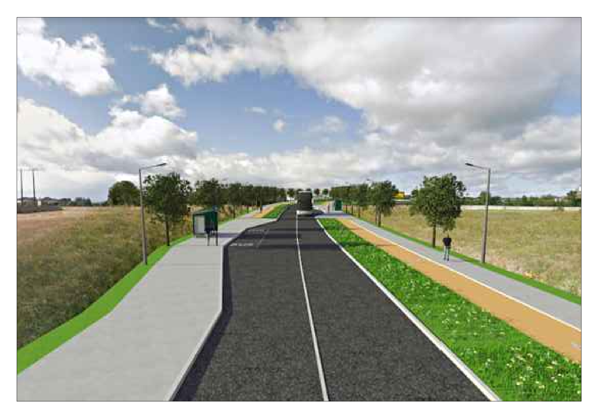
PROPOSED DUNBOYNE BUSINESS PARK ROAD VIEW 1