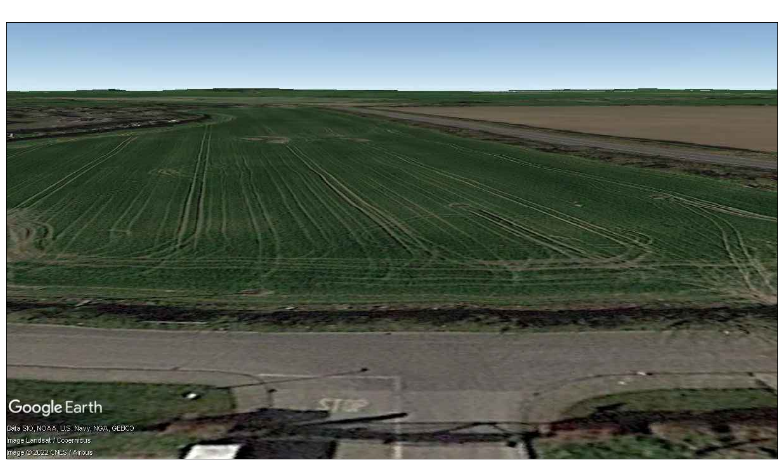
EXISTING THORNTONS ACCESS VIEW