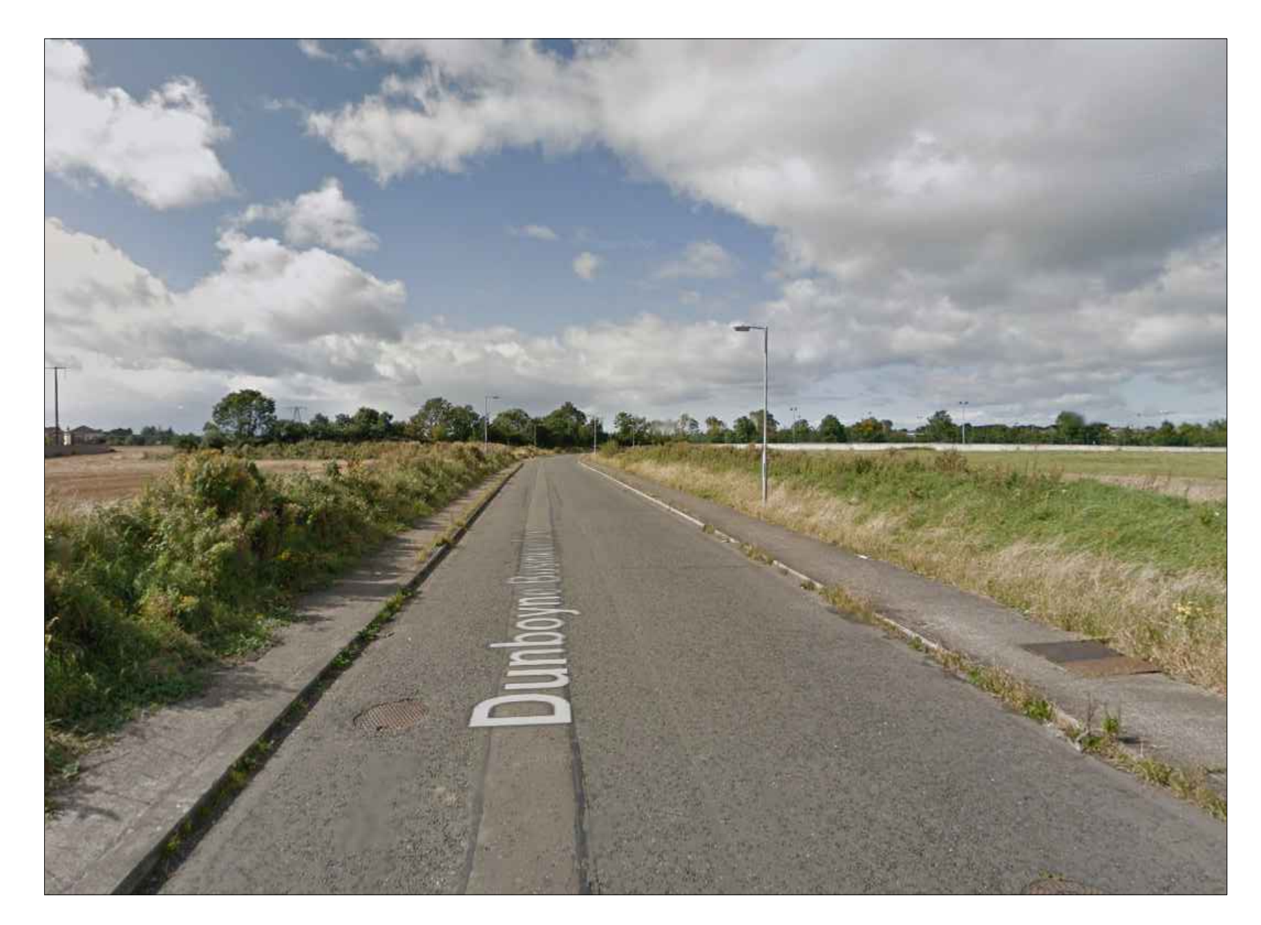
EXISTING DUNBOYNE BUSINESS PARK ROAD VIEW 1