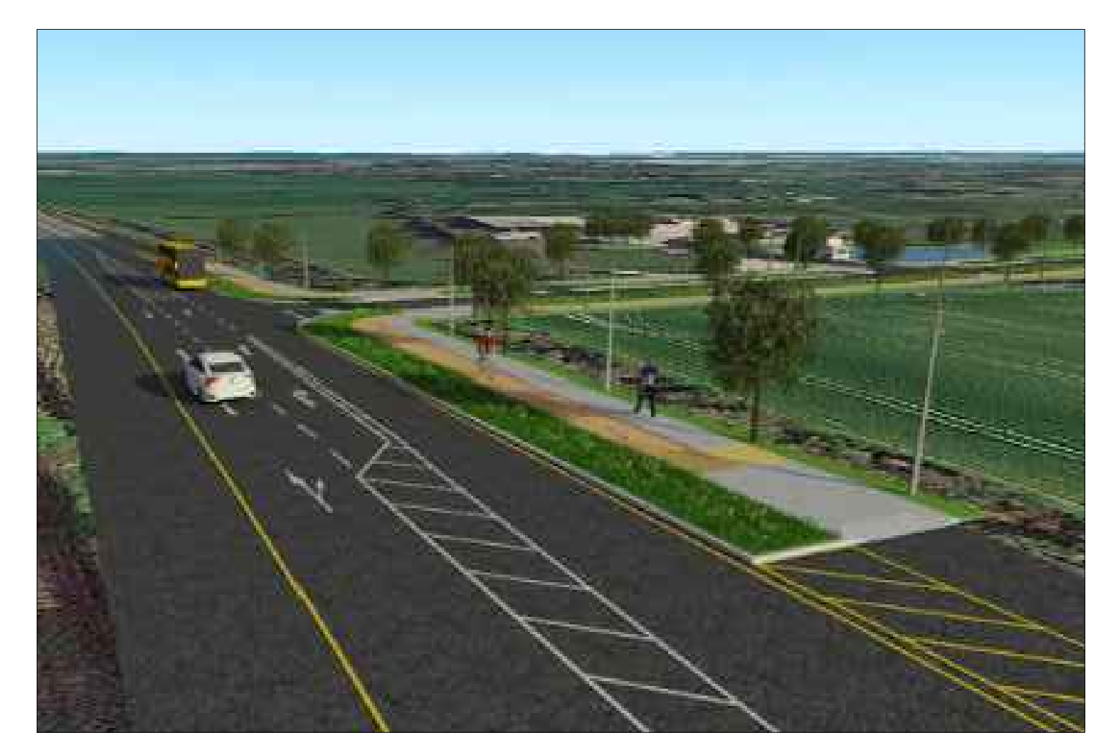
PROPOSED R157 VIEW