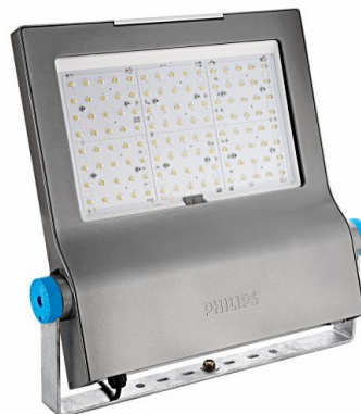
Figure 3. Philips Clearflood