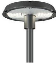
Figure 2. Philips TownTune Central Post