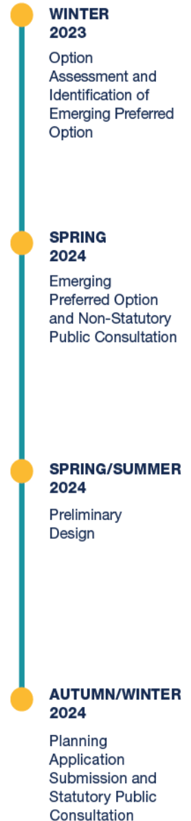
Figure 1: Planning Timeline