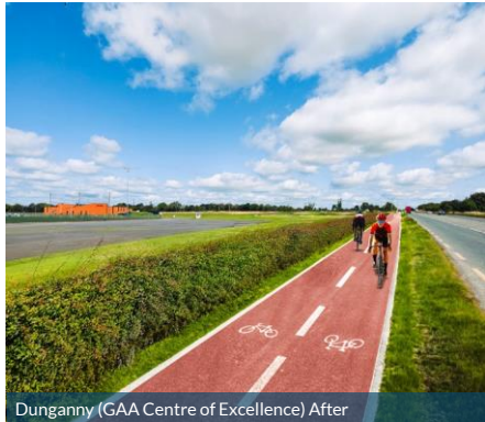
Dunganny (GAA Centre Of Excellence) After