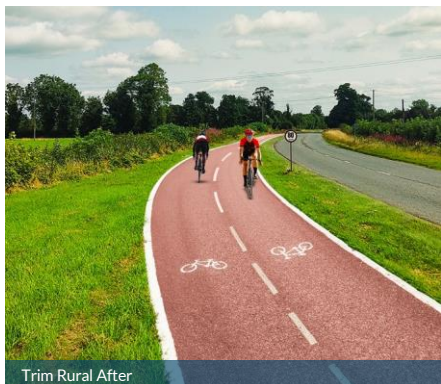
Trim Rural After