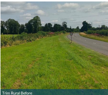
Trim Rural Before