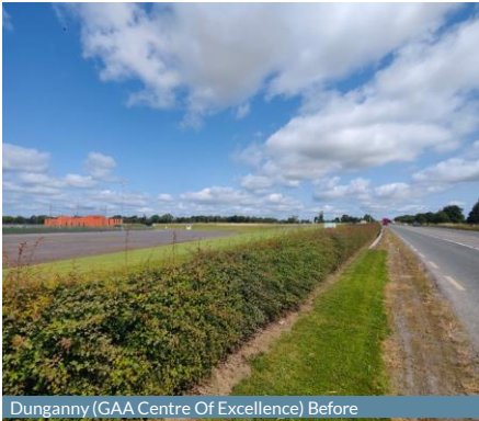
Dunganny (GAA Centre Of Excellence) Before