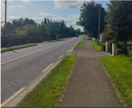
Navan Urban Boundary Before