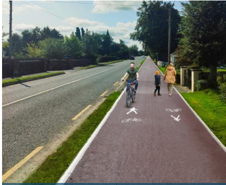
Navan Urban Boundary After