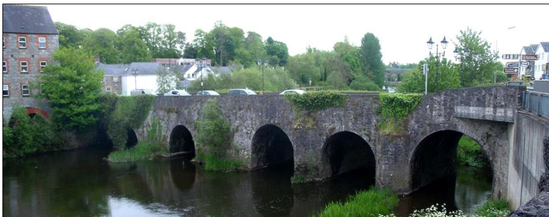
Plate 3.1 New Bridge, Navan.

The proposed route is approximately 2.9 km in length. The majority of the route is proposed within the curtilage of existing road ways and footpaths. The route will include land take from St. Michael's School and former convent on Convent Road. It is anticipated that some trees will be removed on Circular Road as part of the works. The route will tie in to a new pedestrian/cycle bridge which will be cantilevered to the existing New Bridge on the Kentstown Road. Planning for the new pedestrian bridge has been approved under a separate Part VIII application (Planning Reference: P8/17006). From the bridge, the route will travel south along the Kells Road on a cantilevered boardwalk that will carry a two-way facility as far as Circular Road. The route then follows Circular Road before travelling south along the R161 as far as Beechmount Avenue. The cantilevered boardwalk will be constructed entirely from the existing road. No works will be permitted on the natural bank.