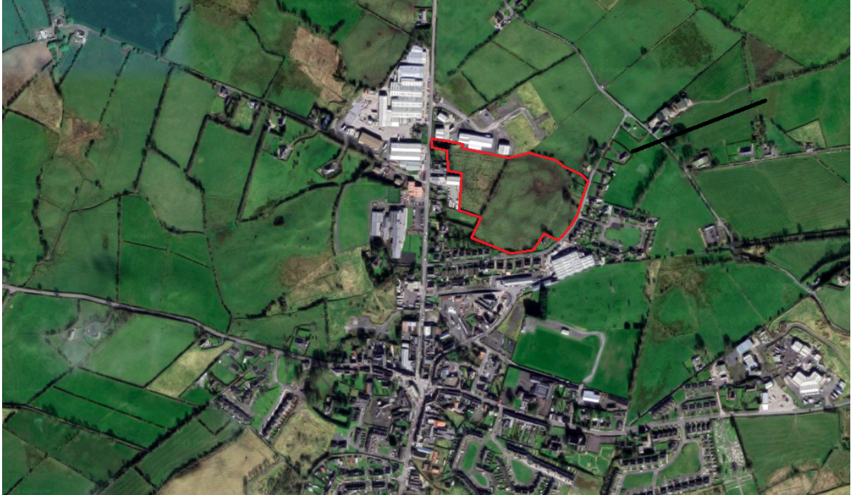
Figure 2.1.: Subject Site Location

The subject site is located in the north-east area of Oldcastle. The lands stand at 13.4 acres (5.42ha). The proposed access point is on the western most point of the site on Cavan/Virginia Street.