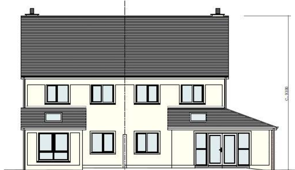
I - TYPE H - TYPE