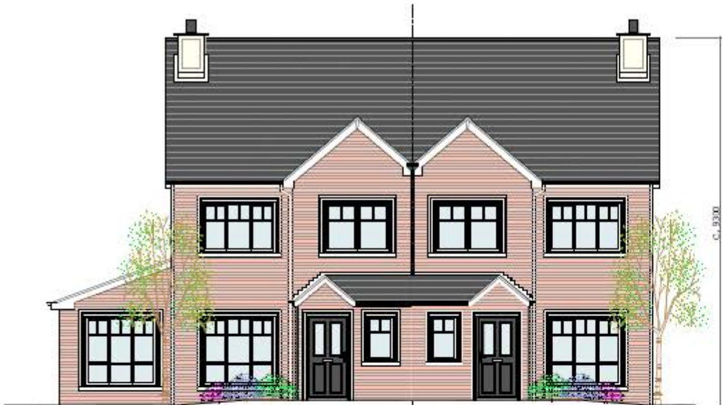
H - TYPE I - TYPE