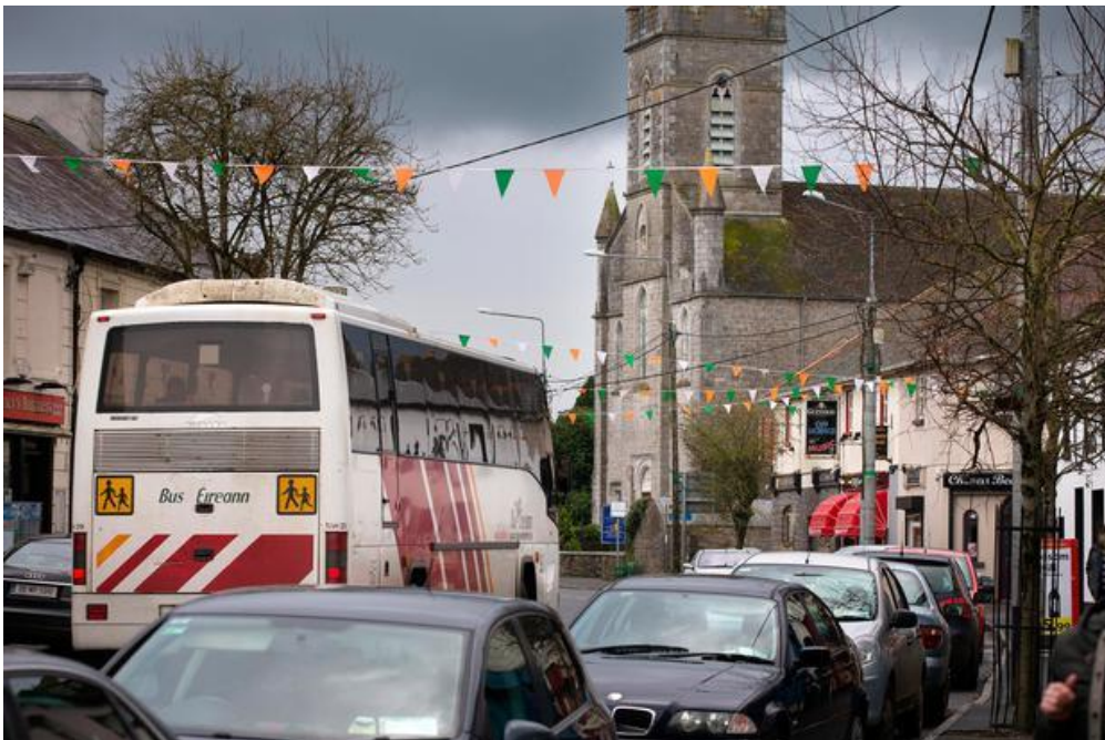
Figure 2-2: Existing Bus Stop Operation in Athboy with Public Transport required to stop on the main street adjacent to parked cars