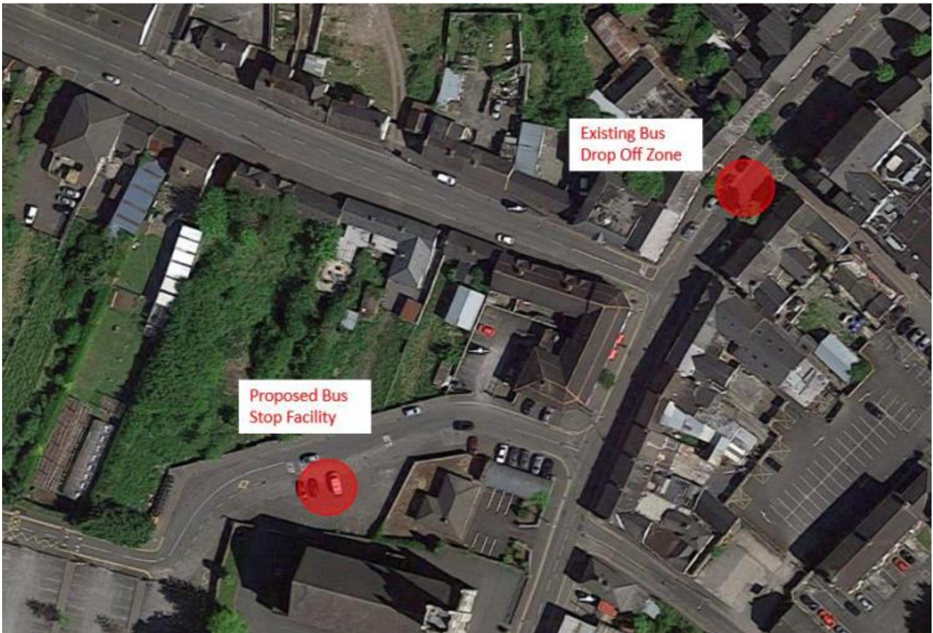
Figure 1-1: Existing and Proposed public transport arrangement. Google Map imagery © 2021