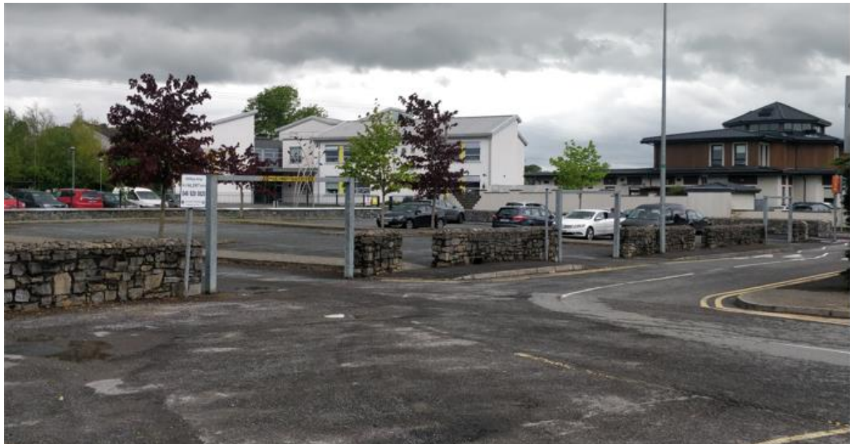
Figure 2-6: Public Car Park split into 3 separate zones