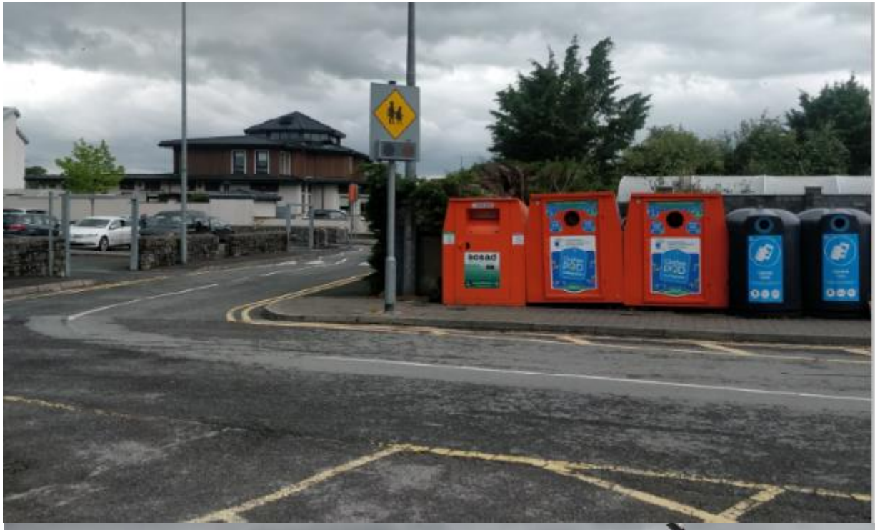
Figure 2-5: Sub-Standard Road Alignment and adjacent Recycling / Bring Bank Facilities

The area contains two public parking zones. One with uncontrolled access as shown in Figure 2-4 above (and which is proposed to become the designated bus stop zone) and a further public car park split into 3 sections with individual single vehicle entry and exit points situated on a sub-standard 90degree horizontal alignment adjacent to recycling/ bring bank facilities as shown in Figures 2-5 and 2-6 below.