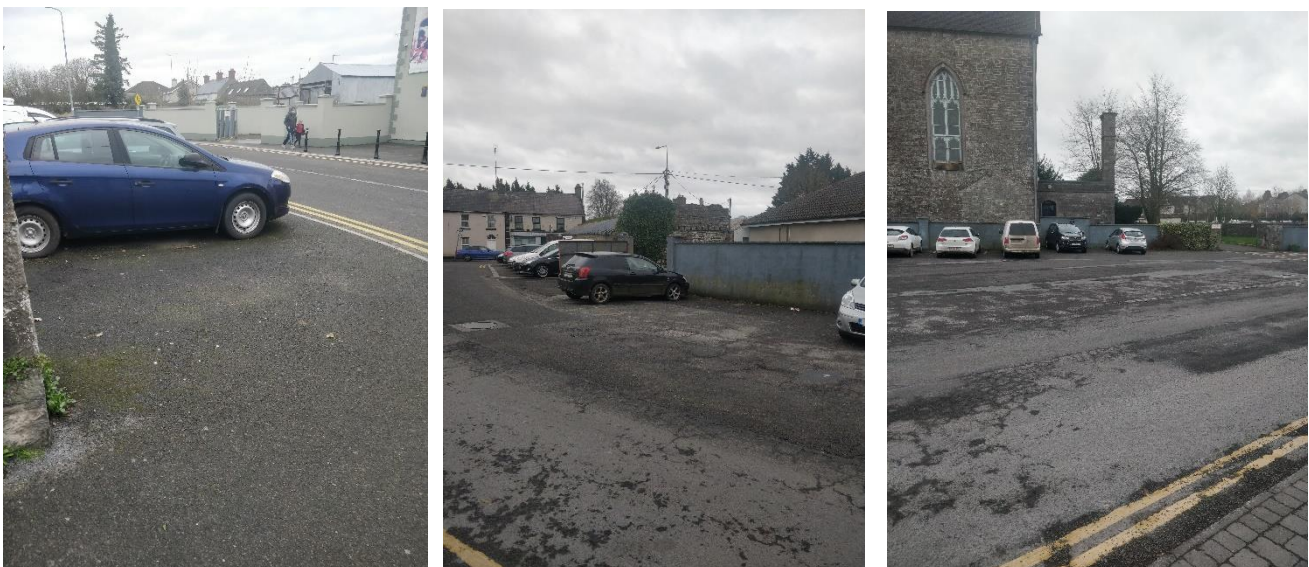
Figure 2-4: Lack of Pedestrian facilities on the Southern Side of the Study Area leading to St. James' Catholic Church, O'Growney National School and Local Creche

The existing streetscape has pedestrian facilities only on the Northern side of the road. The Southern side is bounded by uncontrolled parking and access to the carriageway giving rise to multiple vehicle movements onto the roadway and existing traffic using the parking areas as passing bays avoiding the designated carriageway and alignment of the road. This is of particular concern given the presence of the Church and National School and the likelihood these bring of pedestrians of all ages in the area.