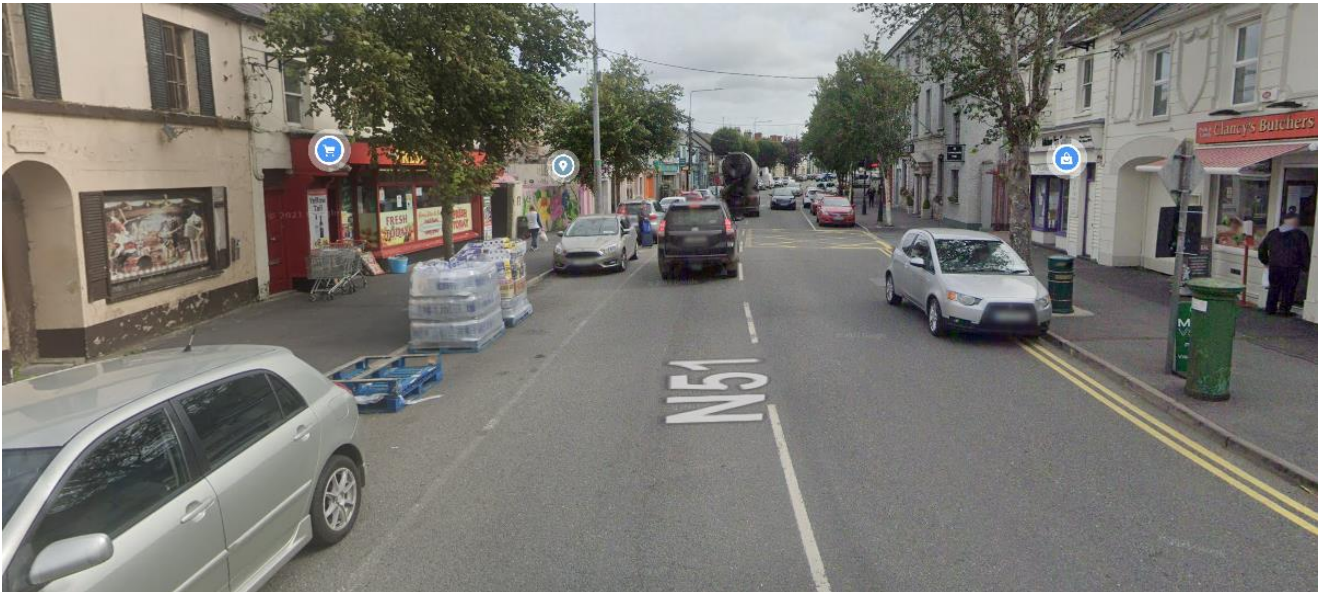
Figure 2-3: N51 Cross Section at the Existing Bus Stop Location (google imagery)

The Study Area identified for the provision of the designated bus stop facility as part of the Athboy Town Centre Project is a side street off the N51 situated along the surrounds of St. James' Catholic Church and O'Growney National School.