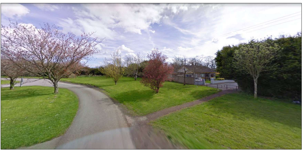
LOOKING EAST TOWARDS SITE FROM BLACKHILL CRESCENT