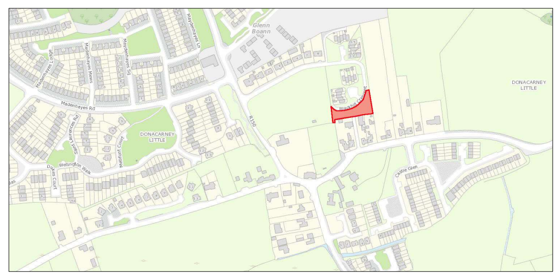
EXTRACT FROM ARCHAEOLOGY.IE VIEW - SITE OUTLINED IN RED

Donacarney is a small village / settlement in East Meath, located close to the border with Co. Louth and east of Drogheda south-eastern suburbs. The village / settlement is positioned between Mornington to the northeast and Bettystown to the southeast. It is centred on a crossroads with a brick National School erected in 1873 and ruins of a smithy, both still existent, also estate cottages still evident located adjacent to the east. The modern development of Donacarney has comprised the construction of suburban housing estates, developed from the 1970s to the present day and includes the recent construction of a new boys and girls national school, Réalt Na Mara located to the south of the settlement and Star of the Sea Catholic Church.