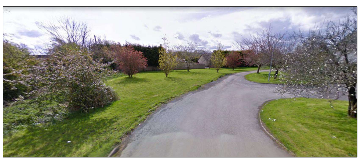
LOOKING SOUTH TOWARDS SITE FROM BLACKHILL CRESCENT – VIEW 2