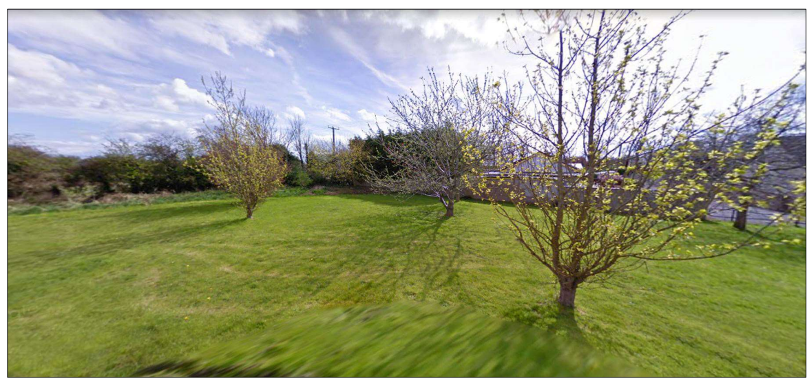
LOOKING SOUTH TOWARDS SITE FROM BLACKHILL CRESCENT - VIEW 1