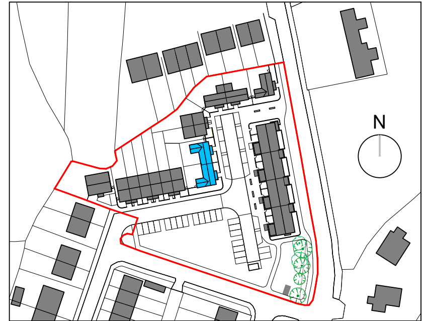
KEY PLAN (NTS) BLOCK C HIGHLIGHTED IN BLUE