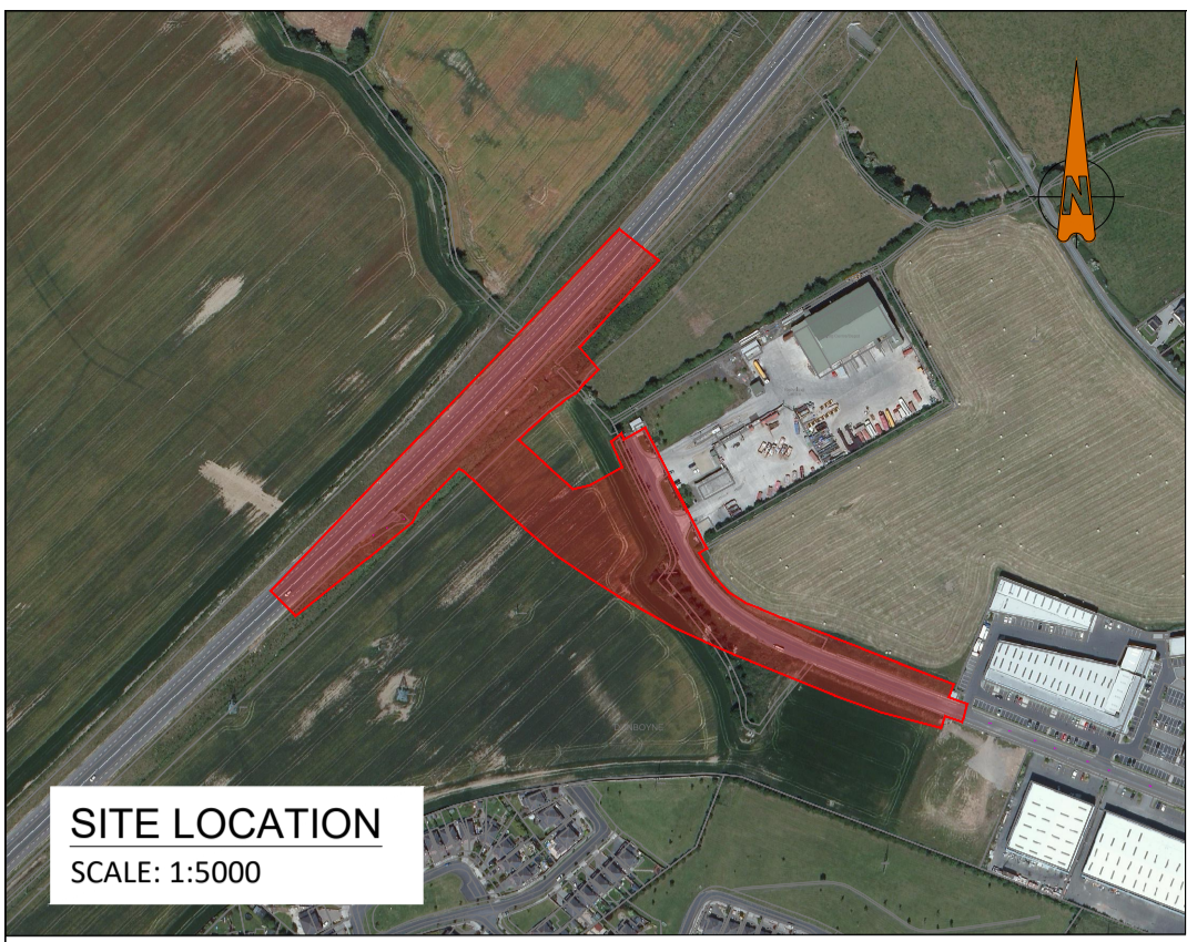
SITE LOCATION SCALE: 1:5000