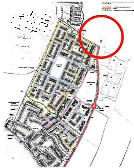
Figure 2: Unfinished outer relief road

Finally, we note that the Public Realm works are being proposed ahead of any movement by Meath County Council, to instigate a Part 8 for the Dunshaughlin Outer Relief Road (DOOR) to the east. This road has already been commenced by Rocktore 1 Ltd and now lies unfinished (see Figures 1, 2 & 3).