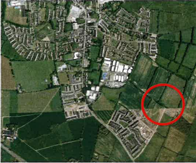
Figure 1: Unfinished Outer Relief Road