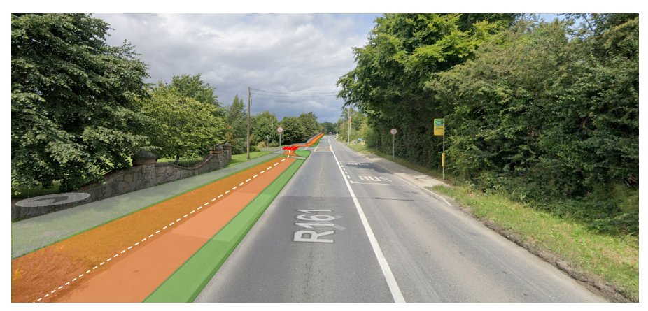
Figure 3b: After - South of Canterbrook Estate on the R161 Road