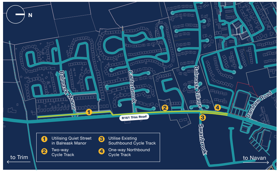
Figure 2: Beechmount to Balreask Manor Route Corridor Map

The emerging preferred route corridor is shown in the Route Corridor Map below: