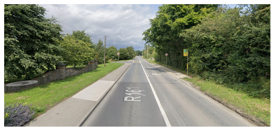
Figure 3a: Before - South of Canterbrook Estate on the R161 Road