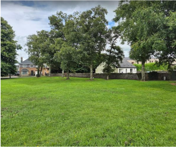
Amenity grassland at the location of the proposed works