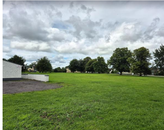
Treeline on the northeast side of Fair Green Park